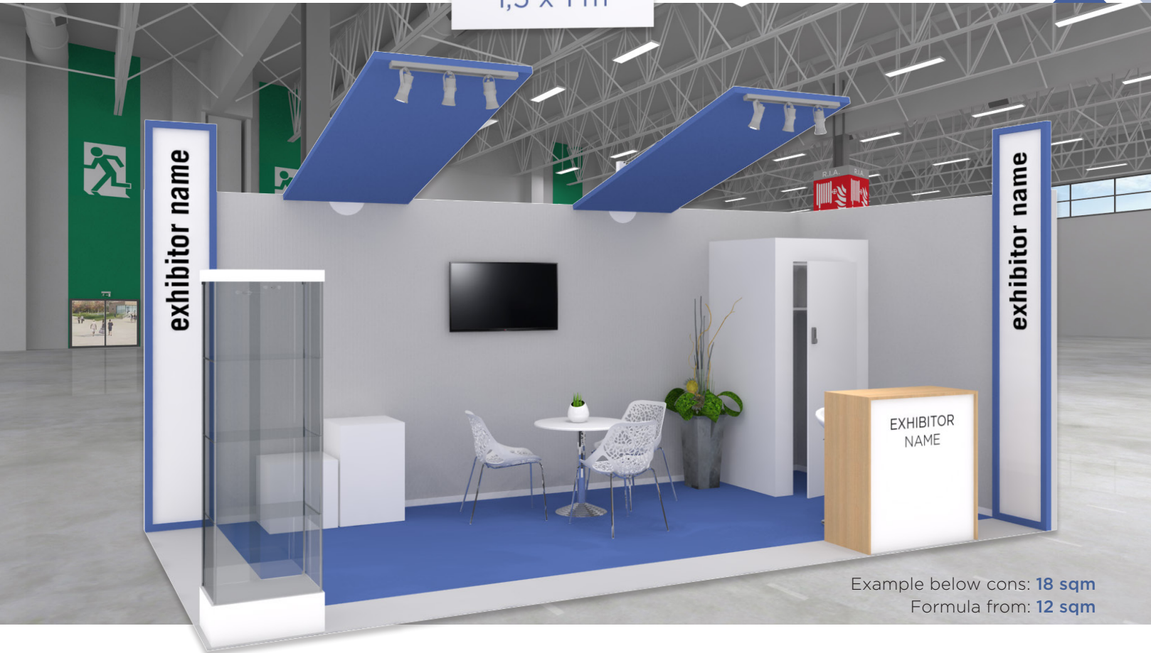
Example below cons: 18 sqm Formula from: 12 sqm