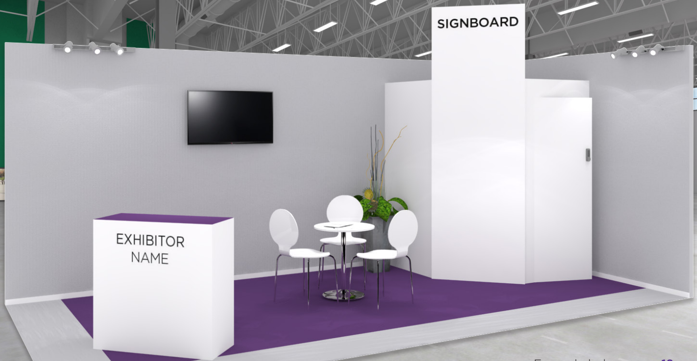
Example below cons: 18 sqm Formula from: 12 sqm