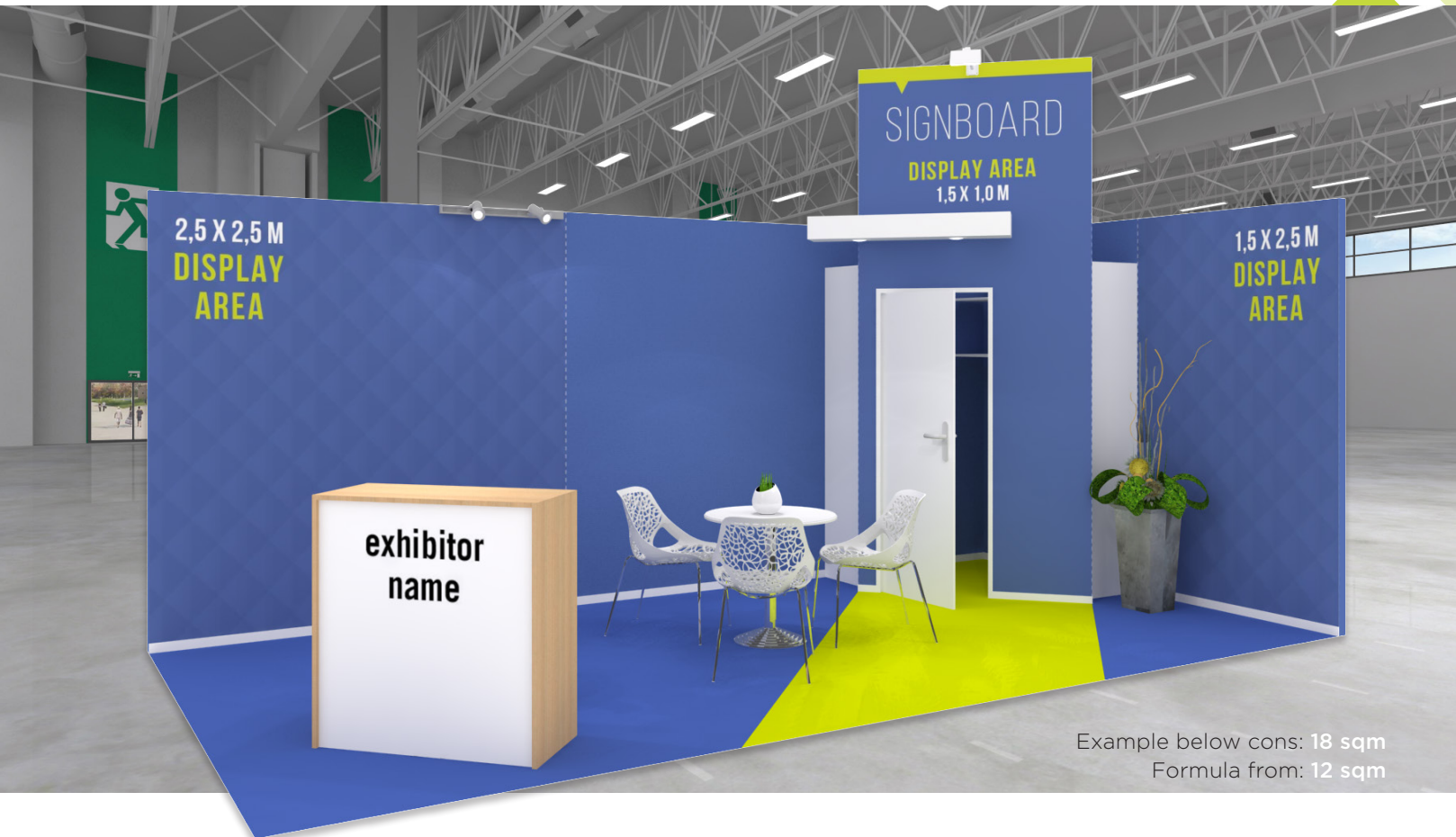
Example below cons: 18 sqm Formula from: 12 sqm